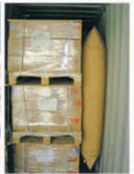
• Dunnage Bag