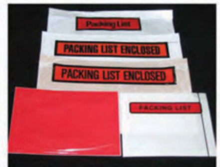
• Customise Packing List Envelope