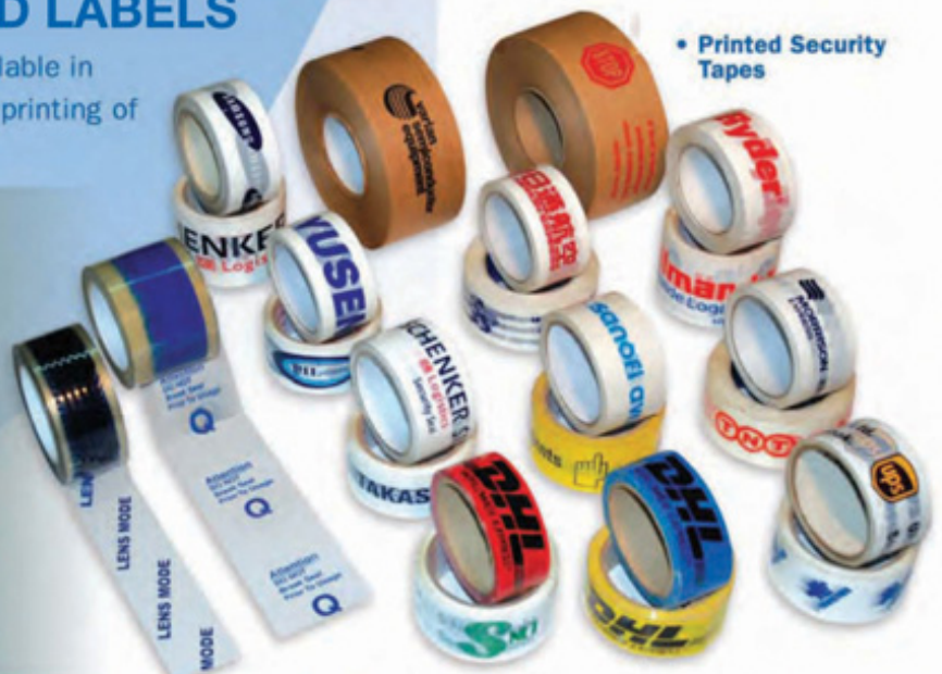
• Printed Security Tapes