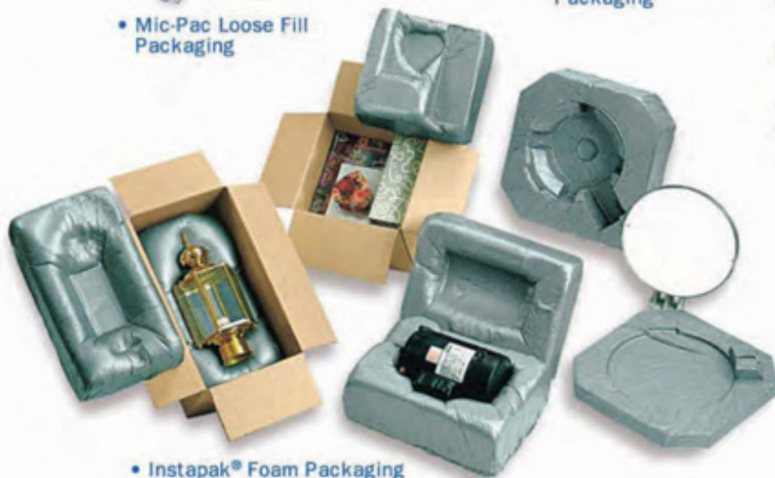
• Instapak® Foam Packaging