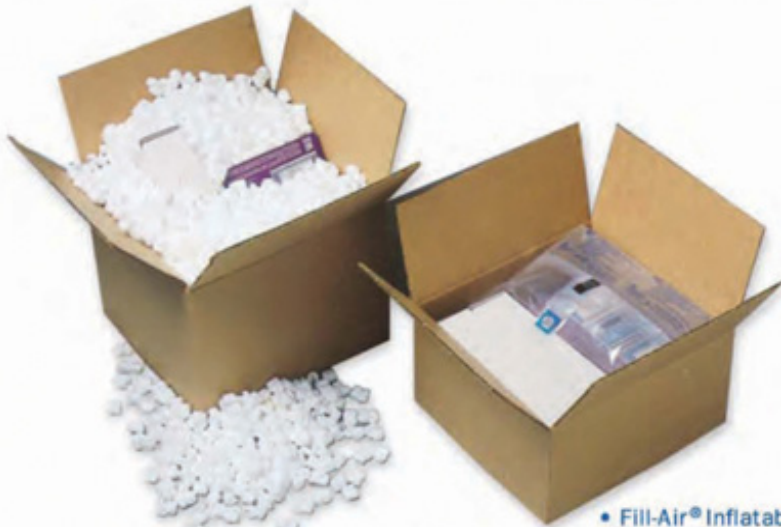
• Mic-Pac Loose Fill Packaging