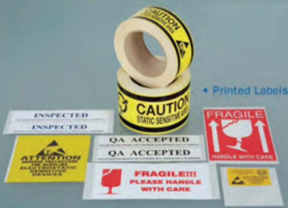
• Printed Labels

Assorted premium quality tapes and labels are available in various sizes and colours customise from design to printing of company's logo/texts.