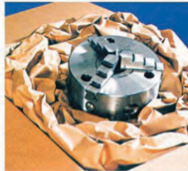
• Paper Cushioning