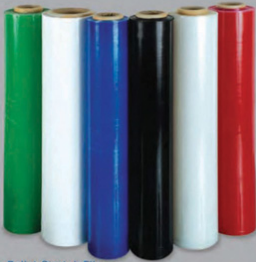
• Pallet Stretch Film Available in assorted colours with antistatic and antirust (VCI)