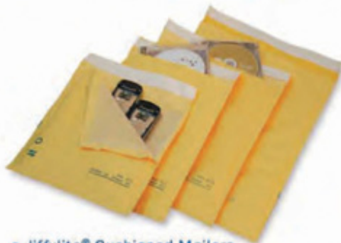
• Jiffylite® Cushioned Mailers