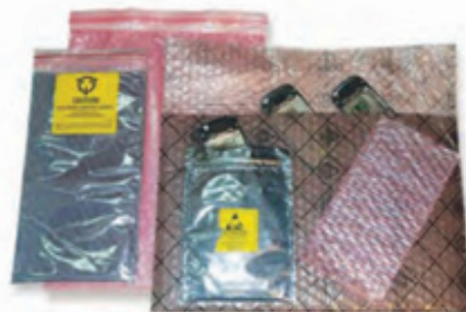
• ESD Cushioning Bags